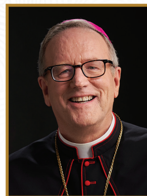
Most Rev. Robert Barron | Diocese of Winona-Rochester